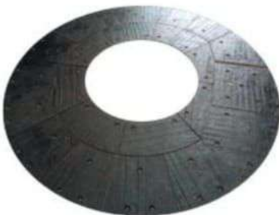
Bottom Plate Set