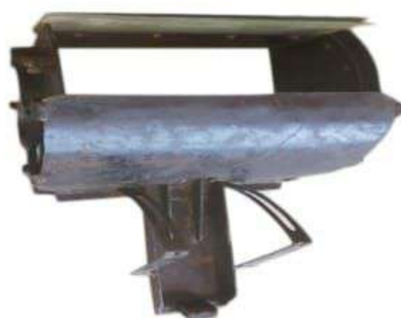
Skip Wire Rope Pneumatic Cylinder Electrical Panel